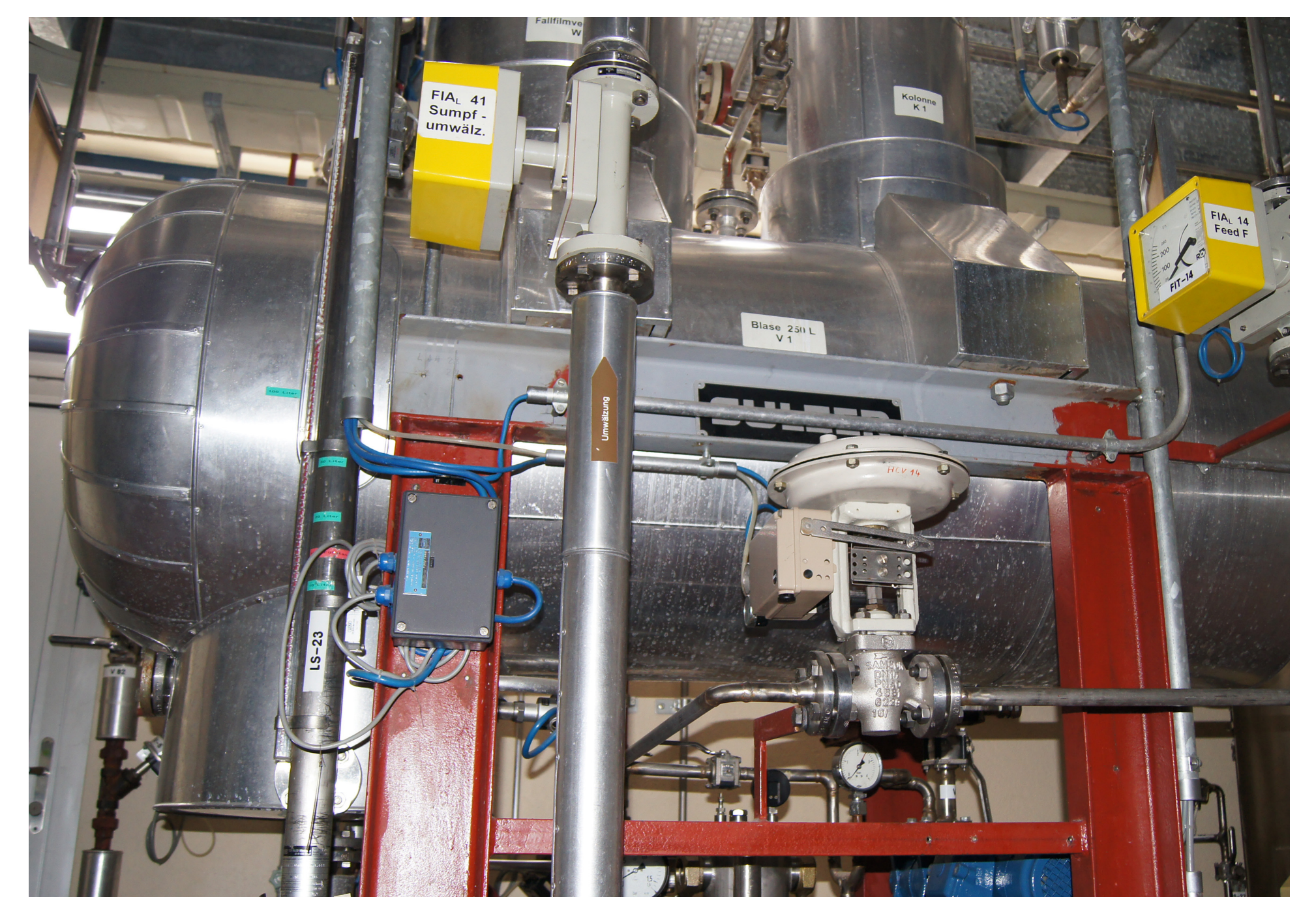
Plant for rectification