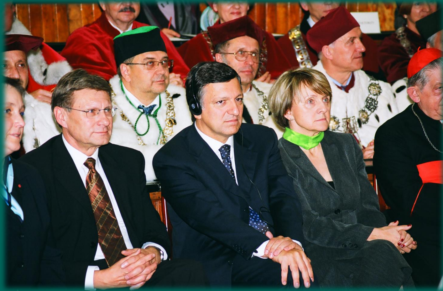
Ceremony of awarding the honorary doctorate to José Manuel Durão Barroso, head of the European Commission in 2007