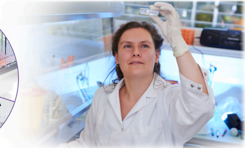
Tissue Engineering for Drug Development and Substance Testing